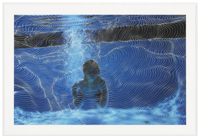
Sebastiaan Bremer I've been holding my breath now for a while now #2 , 2021 Archival pigment print 12-7/8 x 19 inches Edition: 50 Part of the Life During Wartime portfolio