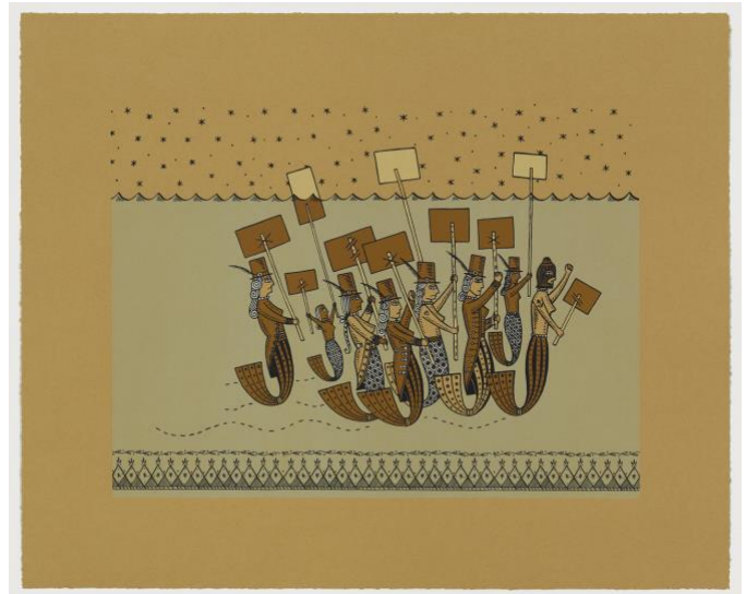
Duke Riley The Sirens of Discontent , 2020 6-run screenprint 19 x 23 ½ inches Edition: 55