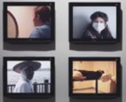
Detail of Hannah Wilke, The Intra-Venus Tapes, 1990–1993.