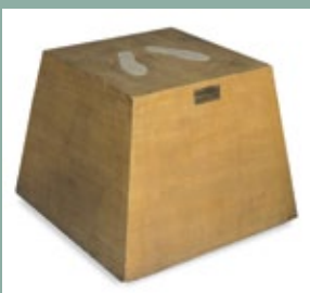
Piero Manzoni, Base magica - Scultura vivente , 1961