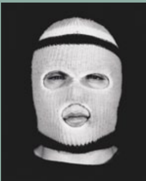
Chris Burden, You'll Never See My Face in Kansas City , 1971