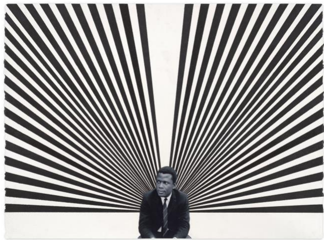
Rico Gatson, Sydney , 2022. Color pencil and photograph collage on paper. 22 x 30 inches.

(TAMPA, FL – April 24, 2023) The USF Contemporary Art Museum, part of the Institute for Research in Art in the USF College of The Arts, presents Rico Gatson: Visible Time . For more than two decades, Brooklyn-based artist Rico Gatson has been celebrated for his vibrant, colorful, and layered artworks. Inspired by significant moments in African American history, identity politics and spirituality, his oeuvre includes images of protests and longstanding injustices—touching on subjects like the murder of Emmett Till, the Watts Riots, and the formation of the Black Panthers—as well as dynamic abstract geometries that celebrate Pan-Africanist aesthetics and Black cultural and political figures.